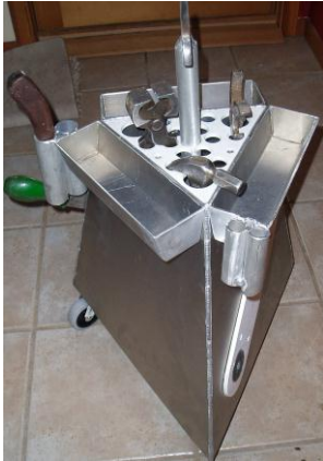
3" Casters 4 Magnets 2 Knife Holders