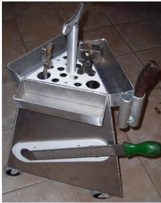
Top Tool Design New Handle 2011